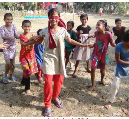
... and play games in Hatbash CDC.