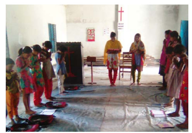
Sunday School in Hatbash CDC