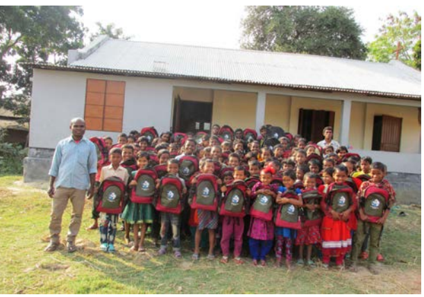
Children are happy about their new school bags in Kalupara