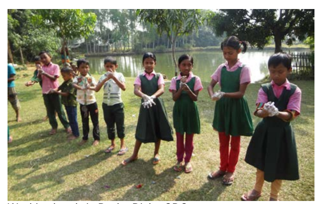
Washing hands in Bachu Dighe CDC