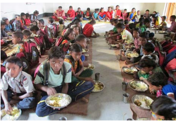
... and in Kalupara CDC.